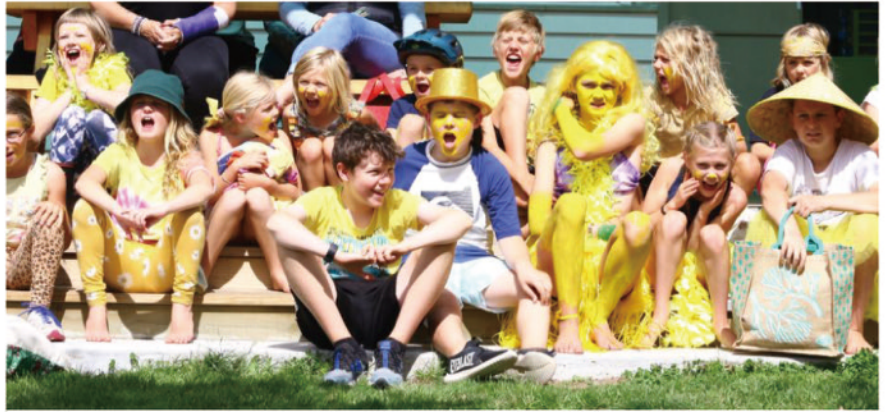
Yellow house students make some noise for their team at our school triathlon ☺