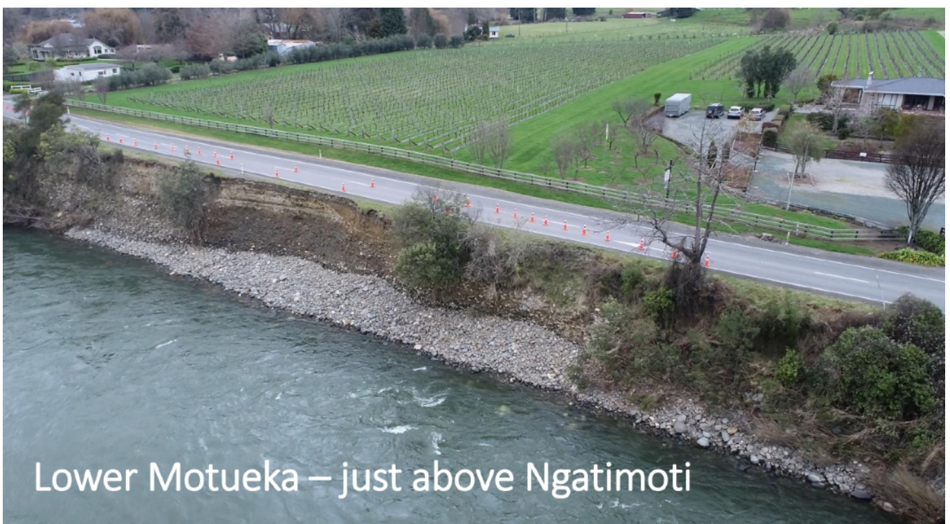
Lower Motueka – just above Ngatimoti

Gravel – its movement and extraction of it – was also discussed, and MCC are planning to hold a meeting on gravel next year 14 th March. Before then, TDC will be assessing gravel levels, the amounts and qualities, and documenting where and what type of gravel is in the river. Extracting