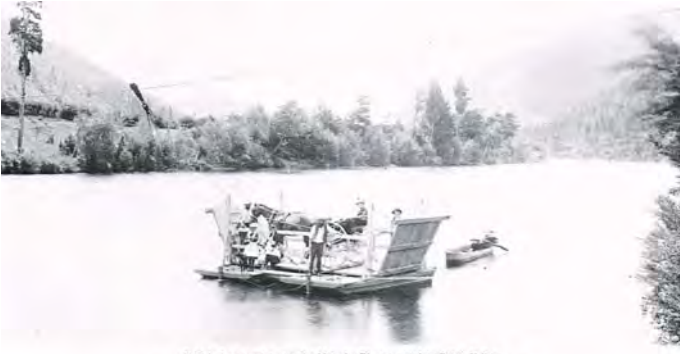
Vehicle ferry punt across the Motueka River on road to Baton Valley.