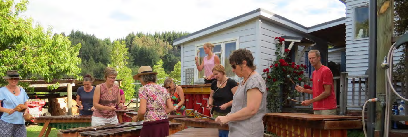
MOTUEKA VALLEY MARIMBA BAND: The band, established in 2015, will entertain at the MVA community picnic on March 19.