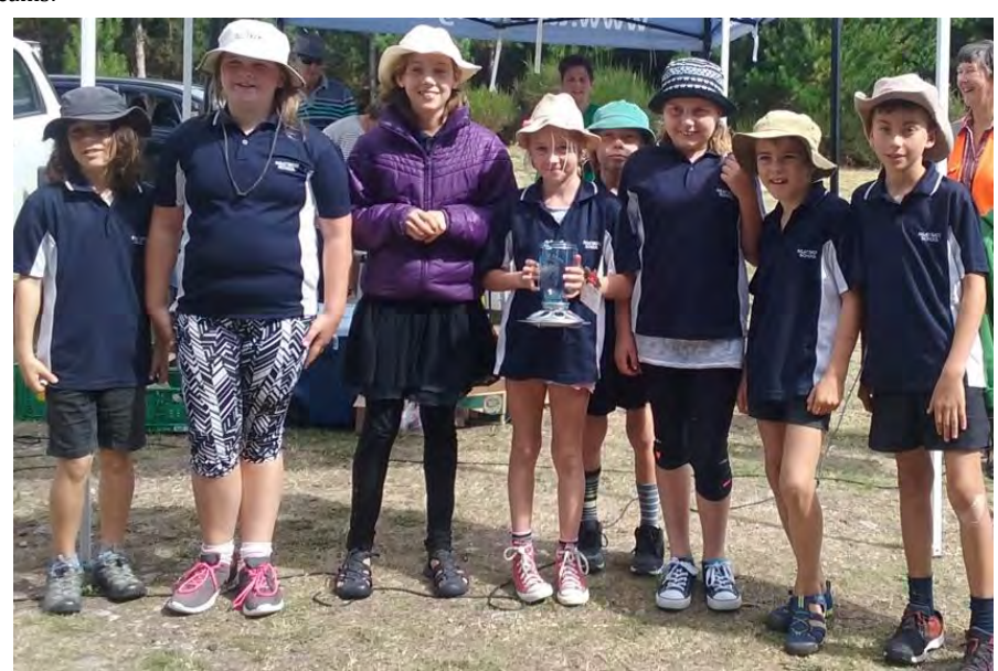
If you are interested in what is happening here at school, or are looking at enrolling your child here, we will be pleased to see you! Please phone 526 8842 for an appointment.

Our Enviroleaders recently completed the Moturoa Mission at Rough Island along with many other enviroschools. Our representatives did really well – thanks to the parents who supported our teams!