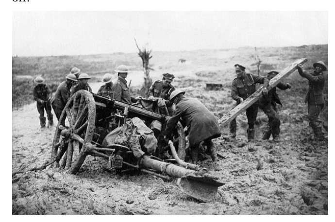
Trying to shift a field gun at Passchendaele

As part of a failed attempt by II ANZAC Corps on 12 October 1917 to capture Bellevue Spur during the First Battle of Passchendaele, the advancing Kiwis soon found themselves in trouble as they faced fierce enemy resistance and swampy terrain transformed by heavy rain and hundreds of trampling feet into a churned-up quagmire. They struggled to make headway in the deep, clinging mud, unable to stabilise their field artillery or bring forward heavy guns for support. Trapped by barbed wire and exposed to raking fire from German machine-gunners positioned above, they had no cover but water-filled shell craters. By mid-afternoon the extent of the failure was clear and the Allied offensive called off.