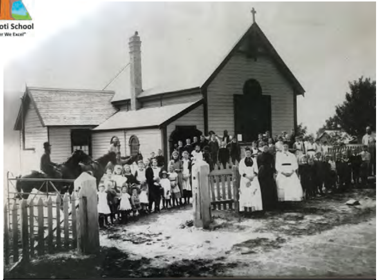
Ngatimoti School in the 1890s