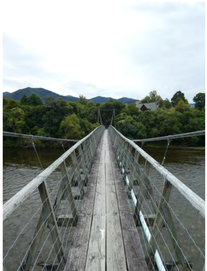
Pokororo swing bridge