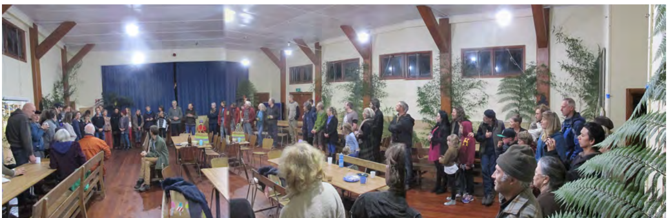
Last year an estimated 100 people came to socialise at the annual midwinter community potluck.