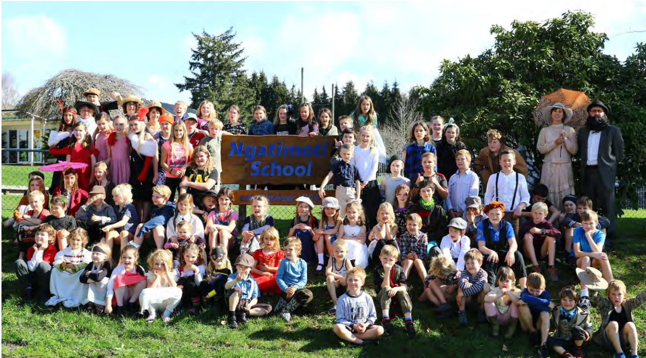
Ngatimoti School teachers and pupils, 17 th August 2018. 150 years of schooling at Ngatimoti.

TERM 3: Mon 23 July - Fri 28 September TERM 4: Mon 15 October - Thurs 20 December 150 th reunion Saturday 20 October Ngatimoti Festival Sunday 21 October Labour Day Monday 22 October