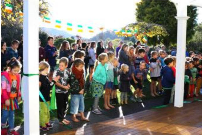
The opening of Rathgar House 7 June 2019