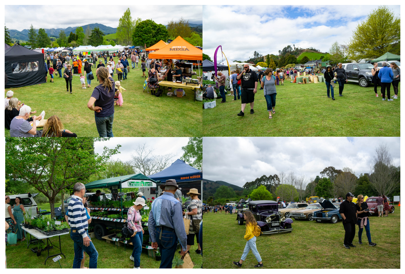
Some more photos of Ngatimoti Festival