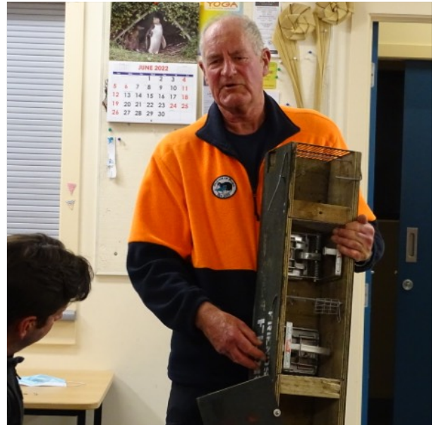
‘Our vulnerable native taonga – wildlife.

Further information can be found from Predator Free 2050 – Practical Guide To Trapping available from the local DOC office in Motueka or online www.doc.govt.nz/predator-free-2050 .