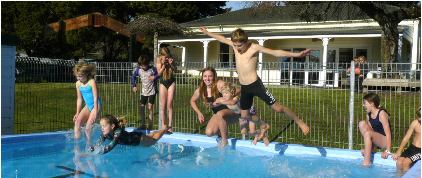
A few hardy students took the plunge for our annual mid-winter swim in the school pool recently!

We are optimistic that our 20 th Festival is able to go ahead this year. Thank you for your continued support!